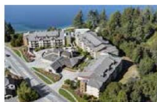
QUEENSTOWN Heritage Queenstown