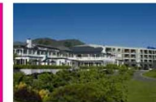
TAUPO Hilton Lake Taupo