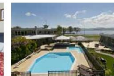
TAUPO Anchorage Resort