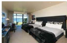
TAUPO Millennium Taupo