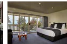
KAIKOURA The White Morph