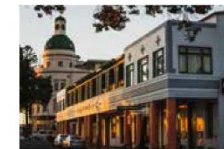
NAPIER Art Deco Masonic Hotel