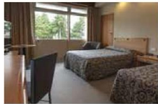
ROTORUA Copthorne Hotel Rotorua