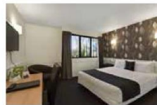
CHRISTCHURCH Quality Hotels Elms