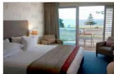
NAPIER The Crown Hotel