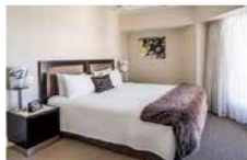
WELLINGTON The Bolton Hotel