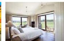
WANAKA Wanaka Haven