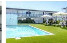
ROTORUA Regent of Rotorua Boutique Hotel