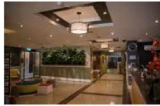
AUCKLAND Auckland City Hotel