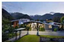
GLACIER REGION Scenic Hotel Franz Josef Glacier