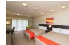
BAY OF ISLANDS Scenic Hotel Bay of Islands