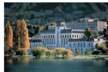
QUEENSTOWN Rydges Lakeland Resort