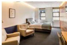
WELLINGTON Park Hotel Lambton Quay