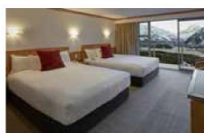
MT COOK The Hermitage Hotel