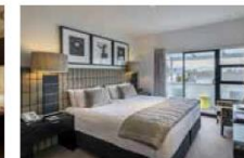
CHRISTCHURCH The George Hotel