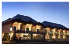
KAIKOURA The White Morph