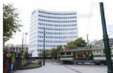
CHRISTCHURCH Distinction Christchurch