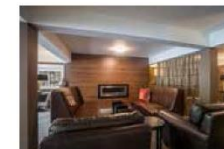
GREYMOUTH The Ashley Hotel