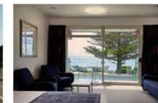
KAIKOURA The White Morph