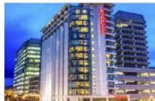
WELLINGTON Rydges Wellington