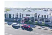
CHRISTCHURCH Pavilions Hotel Christchurch