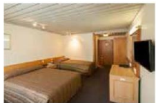
TE ANAU Kingsgate Hotel Te Anau