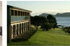
BAY OF ISLANDS Copthorne Hotel & Resort Bay of Islands