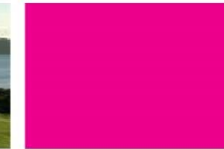
ROTORUA Holiday Inn Rotorua