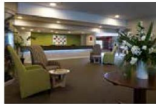
ROTORUA Sudima Hotel Lake Rotorua