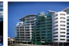
WELLINGTON Distinction Wellington