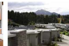
WANAKA Distinction Wanaka