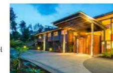
GLACIER REGION Te Waonui Forest Retreat