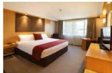
ROTORUA - Millennium Hotel & Resort Taupo Manuels