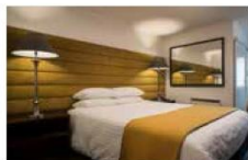
GREYMOUTH The Ashley Hotel Greymouth