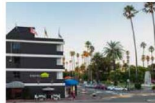
NAPIER Espresso Hotel