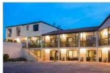
KAIKOURA Lobster Inn Motor Lodge