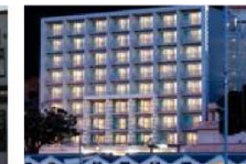
WELLINGTON Copthorne Hotel Oriental Bay