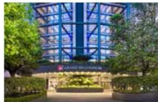
AUCKLAND Grand Millennium