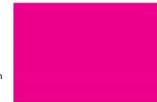
ROTORUA Princes Gate