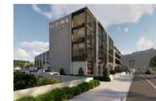
KAIKOURA Sudima Kaikoura