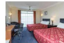
ROTORUA Distinction Rotorua