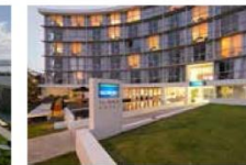
NAPIER Scenic Hotel Te Pania