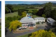
NAPIER Mangapapa Hotel