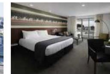
CHRISTCHURCH Rydges Latimer Christchurch