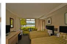
TE ANAU Distinction Te Anau Hotel & Villas