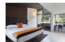
QUEENSTOWN Queenstown Park Boutique Hotel