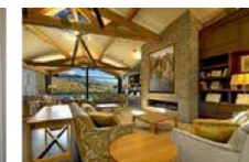
QUEENSTOWN - The Rees Hotel, Luxury Apartments & Lakeside Residences