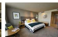
DUNEDIN Distinction Dunedin