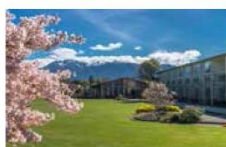
TE ANAU Distinction Te Anau Hotel & Villas