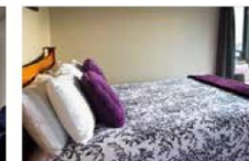
GREYMOUTH Breakers Boutique Accommodation