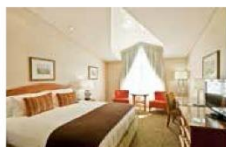
QUEENSTOWN Millennium Queenstown