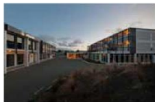
CHRISTCHURCH The Ashley Hotel