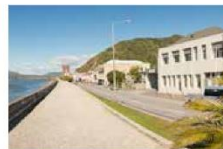
GREYMOUTH Kingsgate Hotel Greymouth