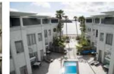
BAY OF ISLANDS The Waterfront Suites